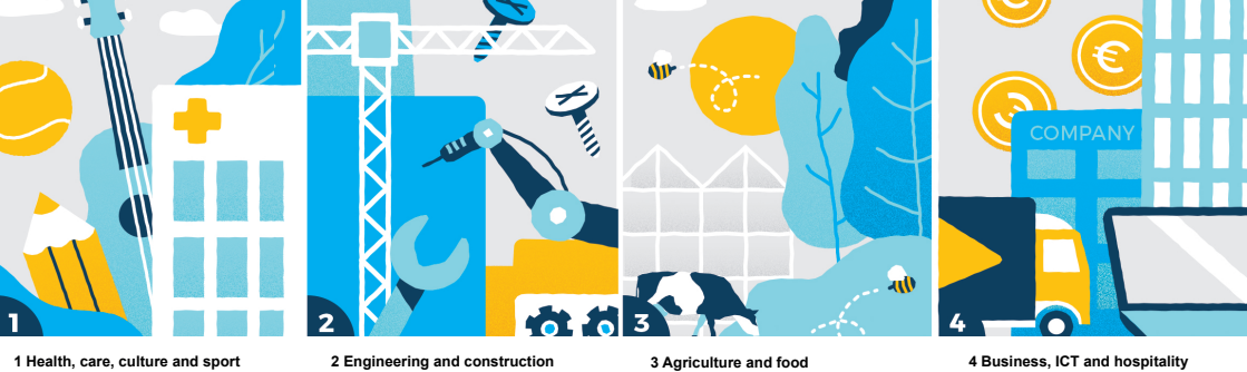
1 Health, care, culture and sport